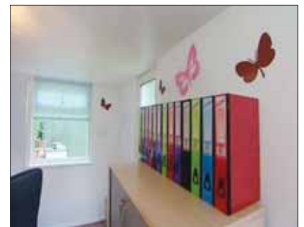
Stills from the show, focusing on the new office